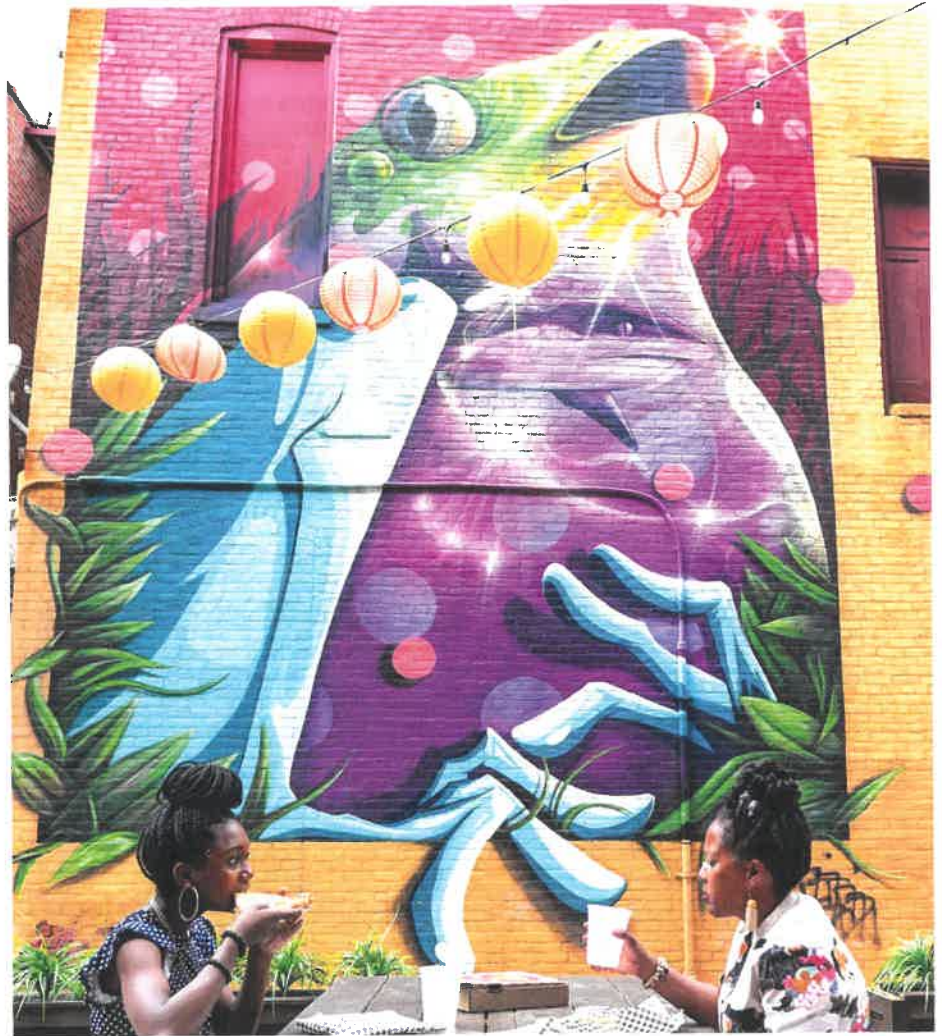
Fort Wayne is a canvas for larger-than-life murals, sculptures, and more on their Public Art Trail.

In Madison, their Arts and Cultural District is one of only 12 such districts in the state, and earned the distinction because of its parks, galleries and studios, museums, art exhibits, and more. With more than 200 years of historic architecture, colorful gardens,