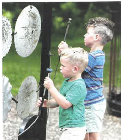
The music garden at Glen Miller Park in Richmond.

So pick a city. Contact the visitors bureau. Ask for a map of public art. And then enjoy.